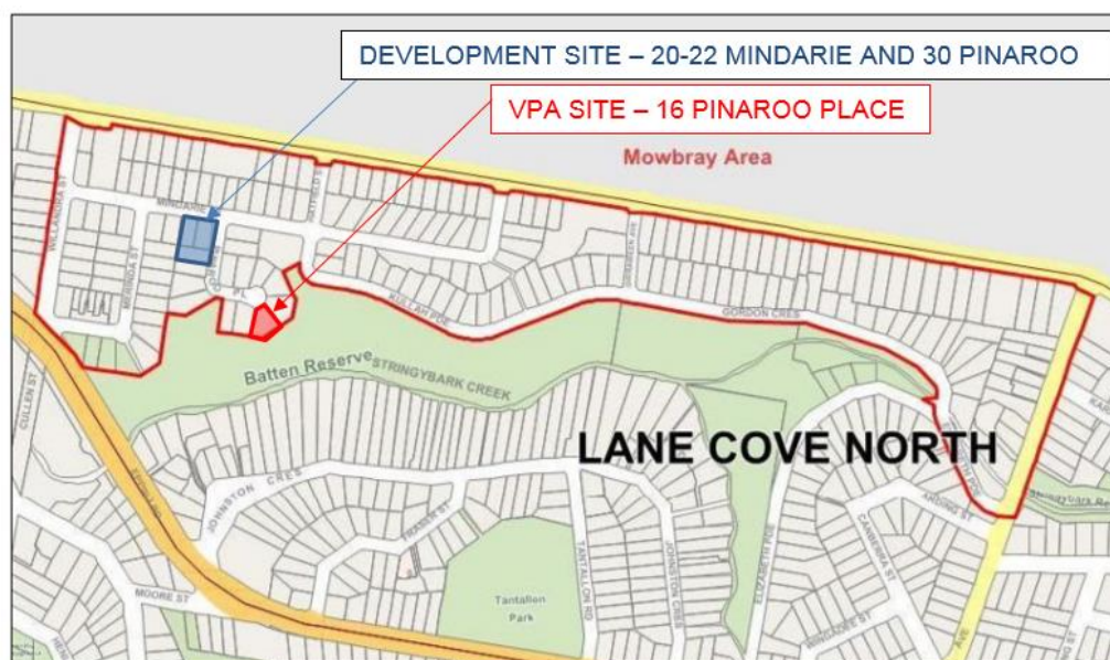
Figure 2: Development Site and VPA Site

A draft VPA was placed on public exhibition from 6 June 2019 to 5 July 2019. Council at an Ordinary Council meeting of 22 July 2019 resolved to enter into a VPA with NSW Land and Housing Corporation. A copy of the draft VPA subject to that report is attached (AT2).